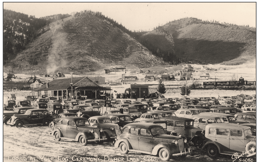
Bottom corner of photo reads "Crowd at Yule Log Ceremony, Palmer Lake, Colo."

"The Winner-Finder of the log rides it back to the Town Hall along with other children. The Hider and the Finder then saw the log in half. Half will be burned in the Town Hall fireplace during the Wassail Ceremony, and the other half will be used for next year's kindling." Rodger Voelker