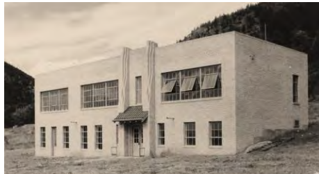
Below right: Palmer Lake Elementary Schoolhouse - March 21, 2015