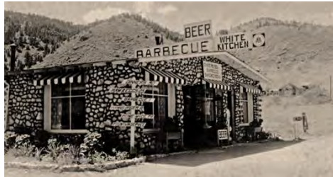
Below right: - Rock House Ice Cream & More - March 20, 2015