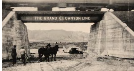
Below right: Highway 105 railroad underpass - March 20, 2015